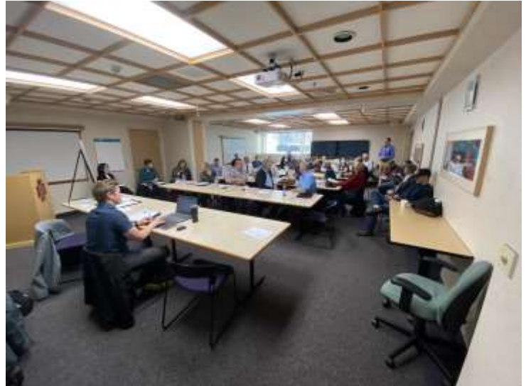
Chapter V February 16th meeting had a great turnout with 31 attendees.