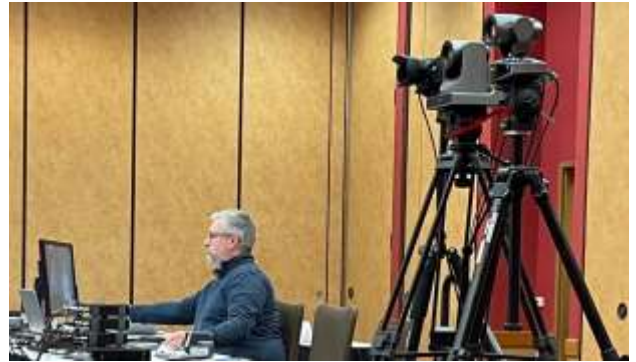
The Glacier Canyon Conference Center made streaming this program to the virtual attendees possible.

You or your organization can still sign up for the 2022 Lunch and Learn webinar programs. As a subscriber, you will receive the recorded links to all the webinars; past ones to review or watch for the first time. These may be watched at any time that you wish. Go to the Education tab at the www.whea.com site, sign up, and start your learning today. You will receive the login information for the next scheduled webinar and the links to all previous recordings. You never have to miss a program again. The cost for the annual webinar series will again be $300 for WHEA members and $500 for non WHEA members. Register now: www.whea.com .