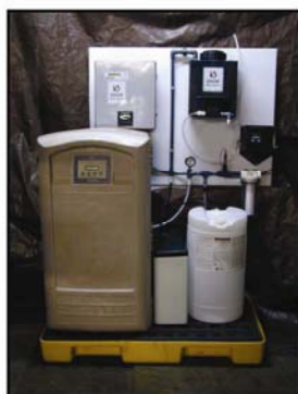
DIOX® Water Hygiene Program

DIOX® Water Hygiene, Cooling Water and Boiler Water Programs Complete Water Management Solutions