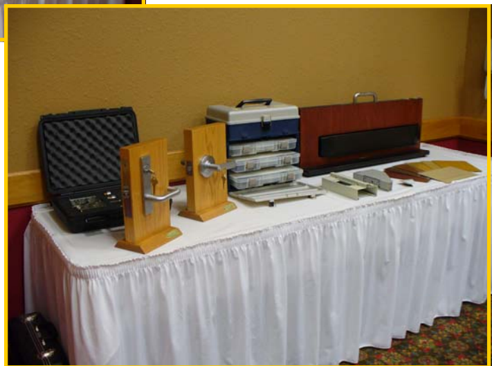
Hands on demonstrations made the “Facility Door Hardware: Function, Fit, and Repair” a valuable educational program.

One site-based educational program, “Facility Door Hardware: Function, Fit, and Repair”, was held at Glacier Canyon Lodge in the Wisconsin Dells. It was very well received and attendees were given important tips on door operation and maintenance and ample time for hands on demonstrations, which made this a very popular program.